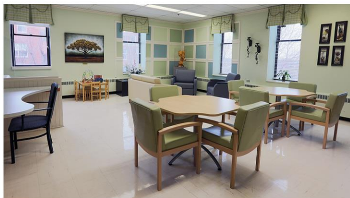
Family room on palliative care unit