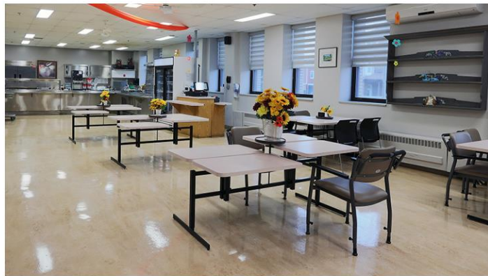
Main dining room