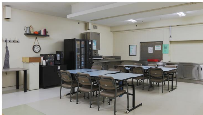
Main dining room