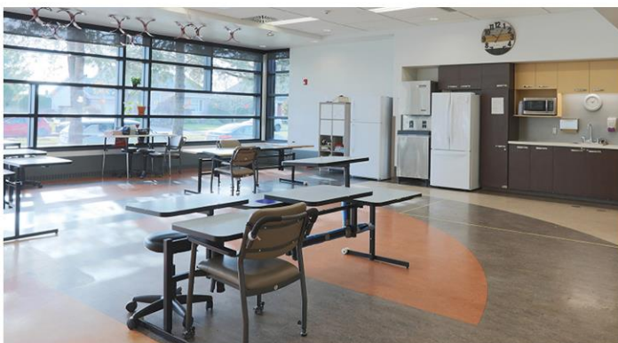
Common room and dining room on the living unit