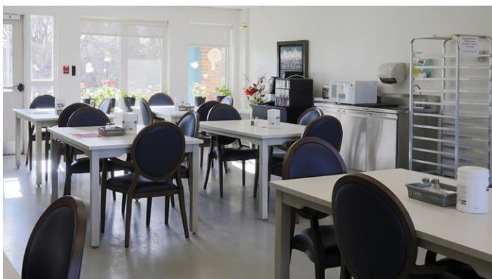
Main dining room