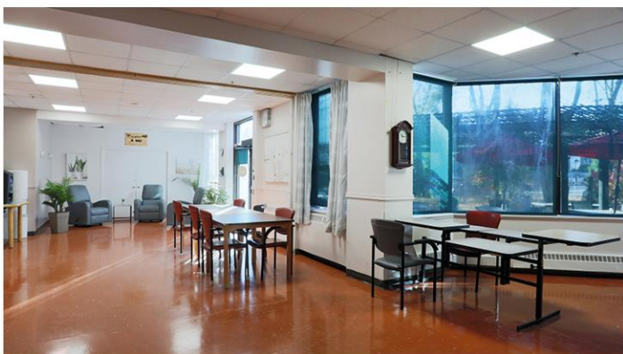
Main dining room