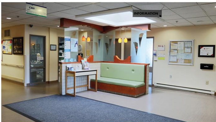
Lobby - Reception