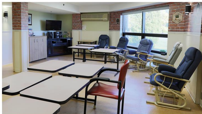
Common room and dining room