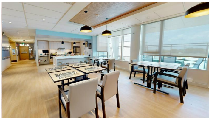
Kitchen & dining room